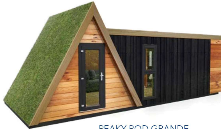
PEAKY POD GRANDE

Like the Peaky Pod, but with an extension, for more space to spread out and relax