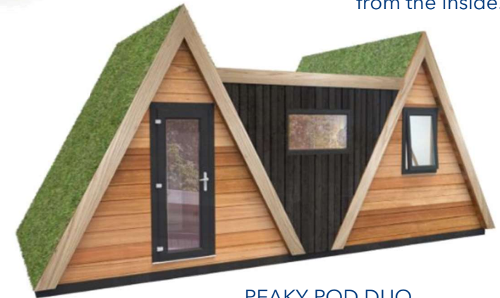
PEAKY POD DUO

The Duo boasts the wow factor of glamping and is the only one of its kind out on the market. Guests will truly remember the distinct shape from the outside along with the space and comfort from the inside.